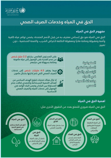
Infographic on the Right to Water