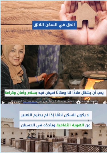
Video on the Right to Adequate Housing